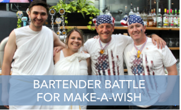
BARTENDER BATTLE FOR MAKE-A-WISH