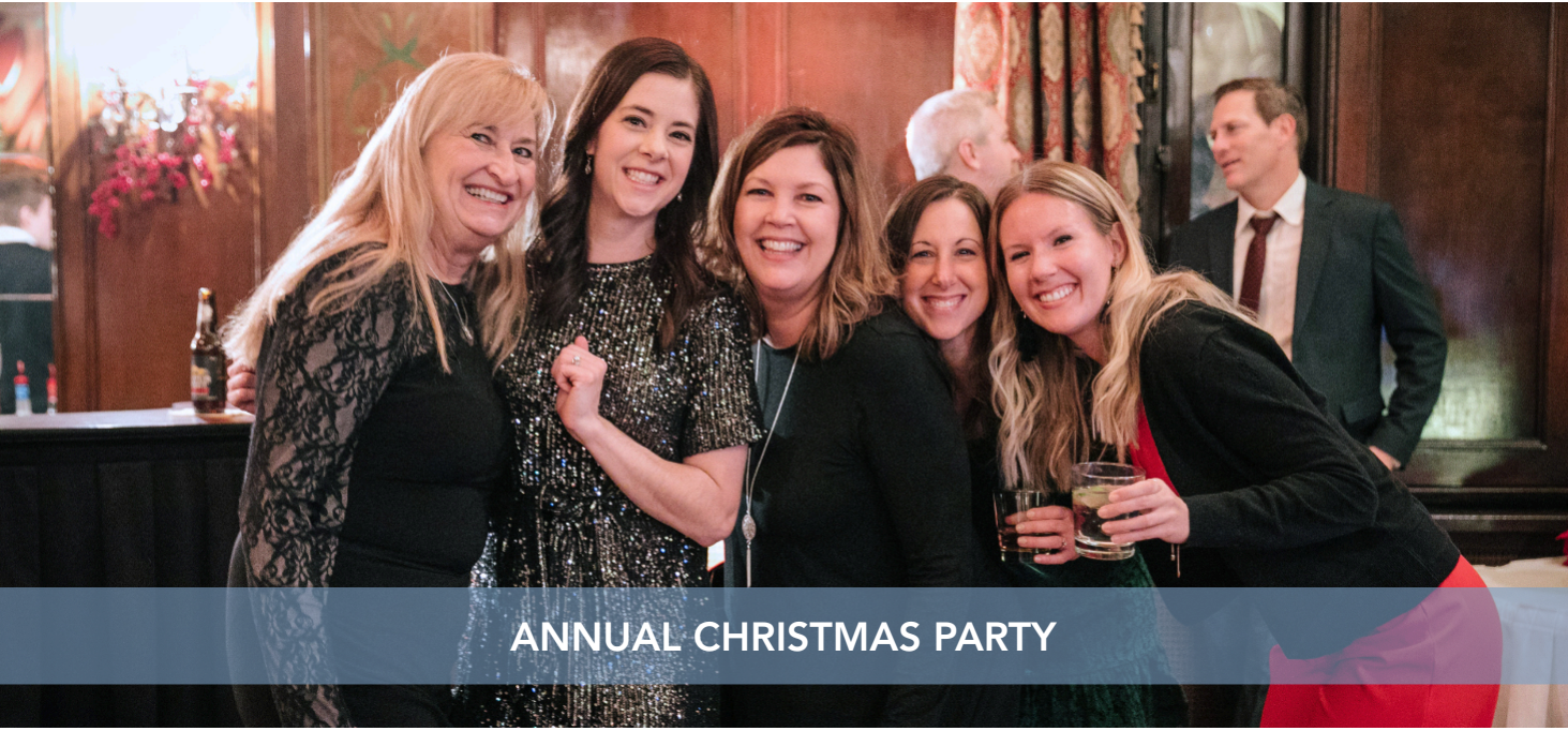
ANNUAL CHRISTMAS PARTY

Undoubtedly, our employees are a family – the Badger Mutual Family. Day in and day out, we support each other, celebrate each other's successes, provide comfort and laughter during the tough times, and come together to ensure we remain the same successful, kind-hearted company we were when we wrote our first policy 130 years ago.