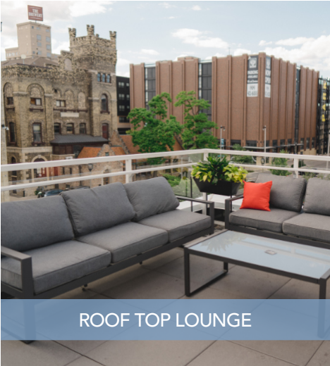
ROOF TOP LOUNGE