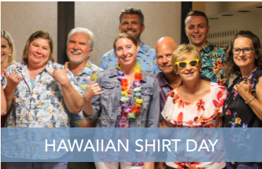
HAWAIIAN SHIRT DAY