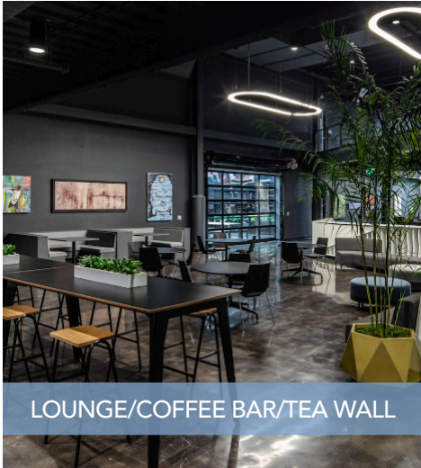
LOUNGE/COFFEE BAR/TEA WALL