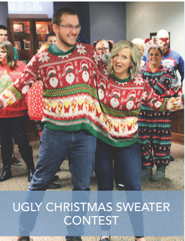
UGLY CHRISTMAS SWEATER CONTEST